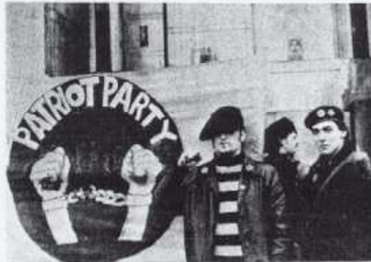
PATRIOTS IN FRONT OF FASCIST COURT

The Patriot Party serves the basic needs and desires of oppressed white people with such programs as Free Breakfast for Children, Free Food Programs, Free Medical Clinics, and Free Lumber Program. It is because of these programs that oppressed white people are, for the first time in the history of this decadent country, recognizing the true enemies of the People. Because the People are moving in the direction to determine their own destiny, the Peoples' Warriors must be eliminated. The Patriot Party will not stand still and see our People being oppressed. We will continue to struggle from one generation to the next.