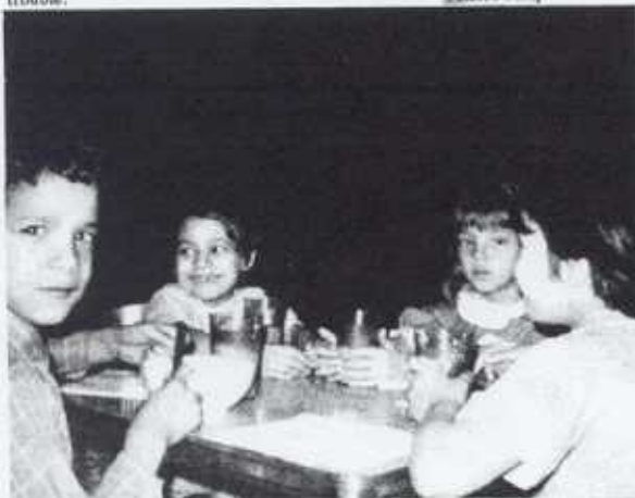
JOHN BROWN BREAKFAST PROGRAM EUGENE BRANCH

ARTICLE I, SECTION 1 OF THE OREGON STATE CONSTITUTION: