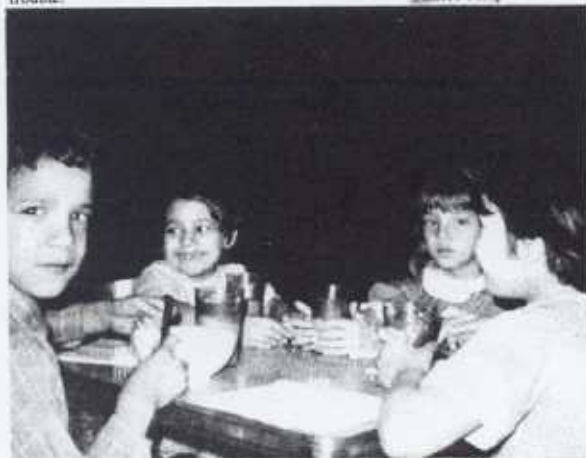
JOHN BROWN BREAKFAST PROGRAM EUGENE BRANCH

The greedy slicksters steal your money by charging super-high prices for materials we need for survival: Food, clothing, housing. They rob our families of unity and love by miseducating our kids to the true nature of this dog-eat-dog society so that our kids get dumber in school, drop out, get strung out on mind muddling drugs, and blame all parents for all this confusion and trouble.