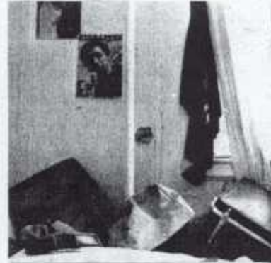
PIGS RUN AMUCK.

PATRIOT PARTY DEFENSE FUND MAIL CONTRIBUTIONS TO: 1742 Second Avenue, New York, N.Y. 10028