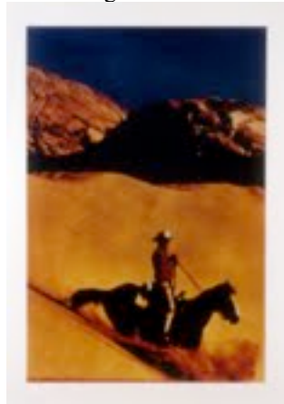
Richard Prince Untitled (Cowboy) 1994 Ektacolor print 60 in. x 40 in.