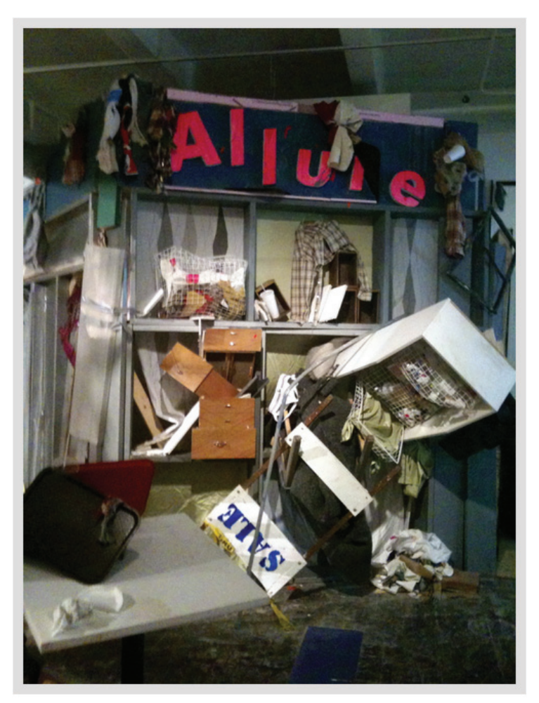
Michael Ruglio-Misurell, Project #12.

In contrast to the in-your-face spectacle of Ruglio-Misurell's disaster zone, Kay Rosen's show is quiet and almost withdrawn (for this artist, anyway, whose text paintings can be billboard-bold in their effects). The walls are sparsely hung, the show consisting of a rarely-seen video shown on a small flat screen monitor, a collection of collage pieces housed in a glass vitrine, another smallish collage and a collection of altered book covers from mystery writer Sue Grafton's bestselling Alphabet Mysteries in which letters spelling out the word 'hijacked' have been excised.