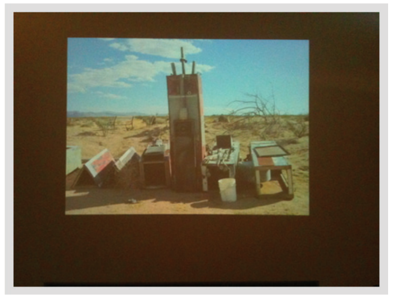
Andrea Zittel, still from Small Liberties.

It's a silent piece, consisting of a series of photographs and short narrative vignettes about the people who have purchased Zittel's A–Z Wagon Stations —custom built units that are a cross between a covered wagon and an air stream trailer for those seeking a space of contemplation and creativity that's entirely their own.